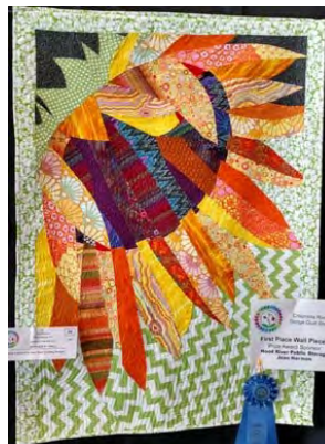
Summer's Smile, Pam Maylee